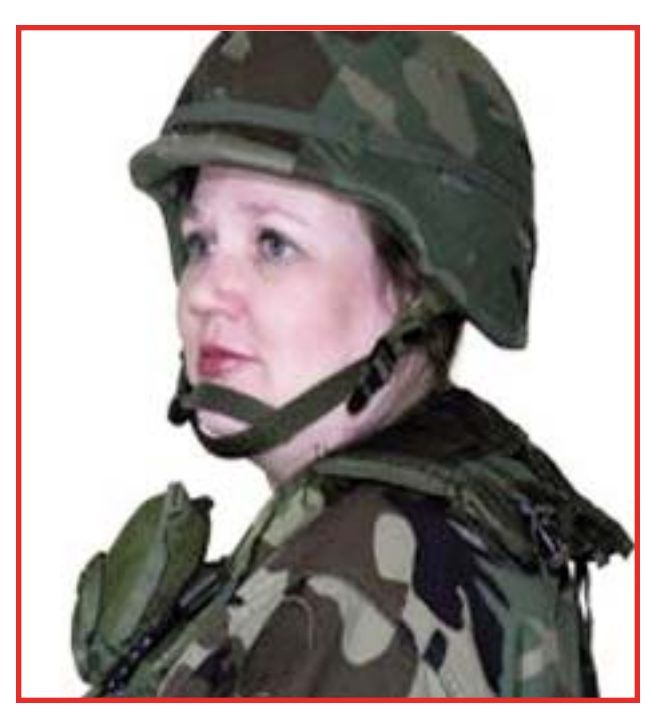
What will it be — A Christian mother at home with children, or a GI Jane?

"Steps can be taken to reduce the anxiety and depression of service women who are worried about what is happening on the home front. In the near future, we hope to identify some areas